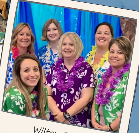
Wilton Bank 2022 Luau