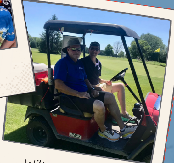
Wilton Bank at the Wilfundy Golf Outing