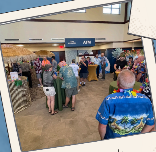
Wilton Bank 2022 Luau