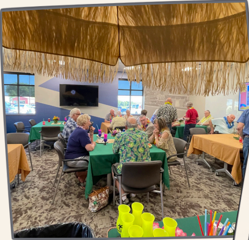
Wilton Bank 2022 Luau