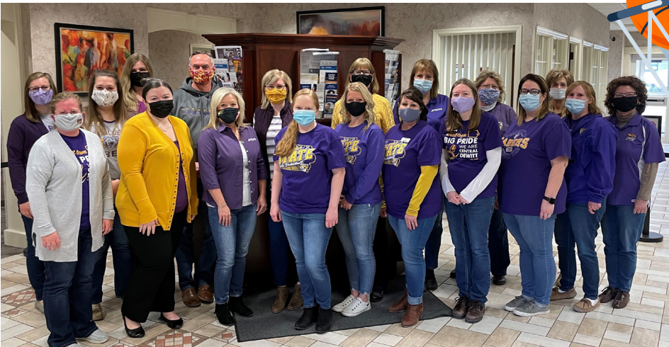
DeWitt Bank & Trust Co. staff cheered on the Central DeWitt Saber Girls Basketball Team on their trip to the State Tournament.