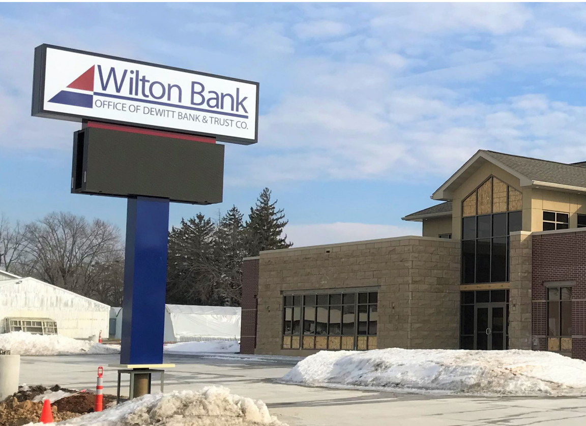
Wilton Bank located at 618 W. 5th Street, Wilton, IA. Opening for service on April 29.

The new bank location will begin offering services on April 29. Until then the bank will still be operating out of the current location located at 104 4th Street, Wilton, IA.