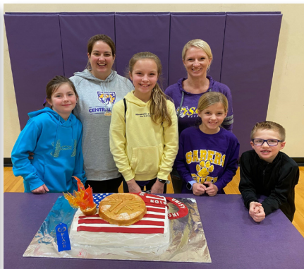
Top Row: DeWitt Bank supports the Saber Athletic Boosters Club cake auction.